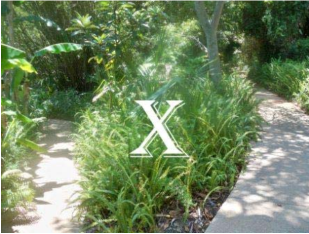
Vietnam Memorial Site